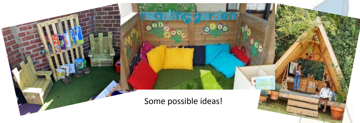
Some possible ideas!